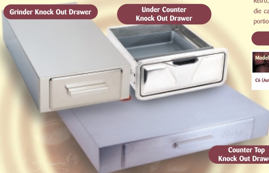
Counter Top Knock Out Drawer